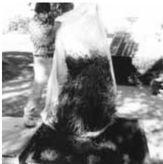
Our fresh lavender is loaded into the onsite distillation stills.

Avalon's master distiller insures the precise temperature for the pressurized steam, which passes through the plant material.