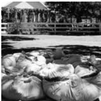
The harvest ready for distillation.