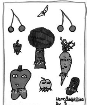
Augustino, age 8