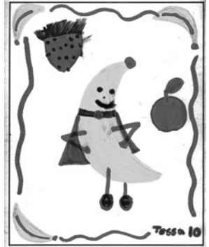
Tessa, age 10