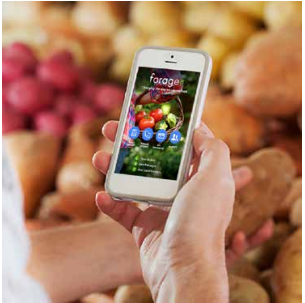
Forager aims to help retailers streamline local produce sourcing right from their smartphones.

Natural retailers also capture improved sales by widening their convenience options in beverage. Exciting data show fortifying your beverage department—which Natural Foods Merchandiser's Market Overview identified as 11.7 percent of total store sales from 2015 to 2016—can be a game-changing income slugger. SPINS data reveal that beverage sales in the grab-and-go category are particularly impressive. In the year ending April 21, 2017, sales of functional beverages (which often contain energizing herbs, spices, botanicals or add-ins like whey or plant-based protein) spiked 5.9 percent to $175.9 million. It's also notable that, while grab-and-go milk and nondairy options in single servings represented fewer sales at $19.4 million, this category grew a remarkable 49.2 percent during the same time period. Recognizing the boost that grab-and-go beverages could offer, Nature's Food Patch recently expanded its section that contained small juices, infused waters and fizzy kombucha by 8 feet, displacing the retailer's beer offerings. Balsley estimates that this one improvement boosted grab-and-go beverage sales by about 20 percent from last year—numbers that will definitely slake your thirst.