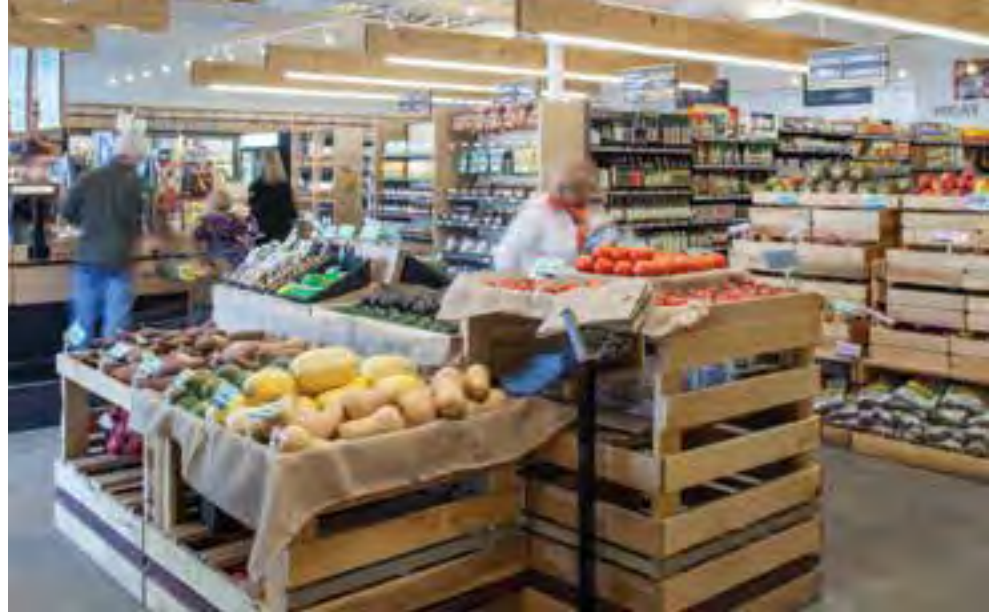
The bountiful produce section at Portland Food Co-op.

The continued desire for local fruits and vegetables is also a boon to produce sections. Not only can prioritizing local produce support farmers in your area, boosting the community feel of your store, but also shoppers are OK with paying a premium for local items. One recent survey from Packaged Facts found that nearly half of respondents said they were “willing to pay up to 10 percent more for locally grown or produced foods, and almost one in three said they are willing to pay up to 25 percent more.” These